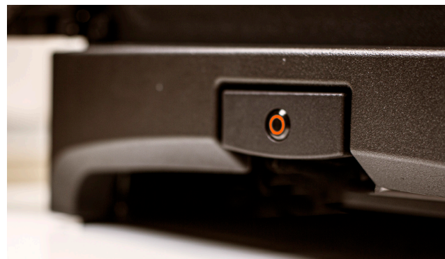
Discreet control button