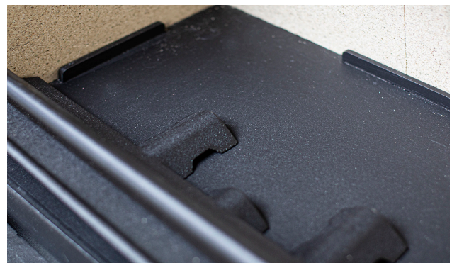
Unique under air delivery system (patent pending)