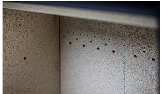
Advanced firebrick technology

Welcome to effortless wood burning. Welcome to Aire Intelligent.