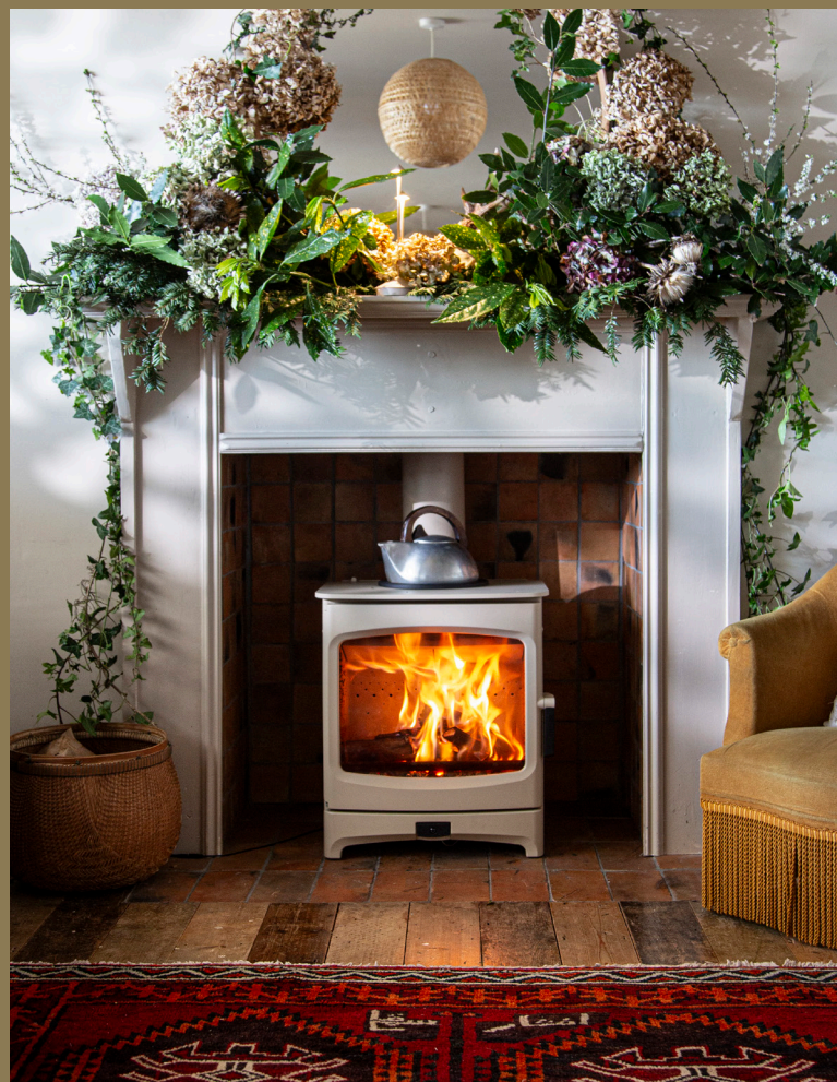
Aire 700 in Almond